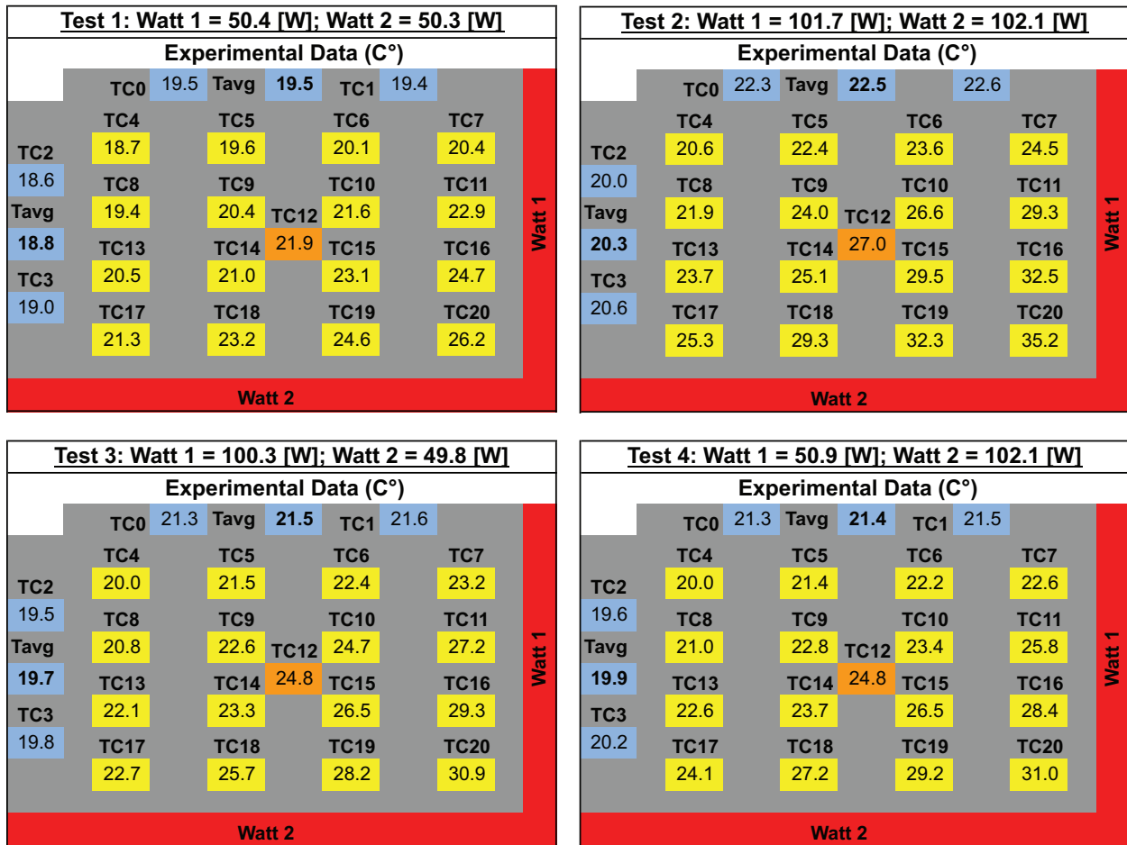
Figure 2: Experimental data